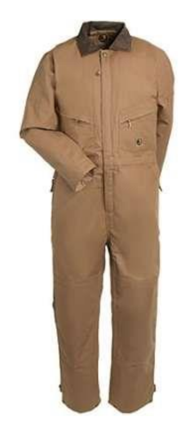
*Counts for two pieces out of 10 piece allotment.