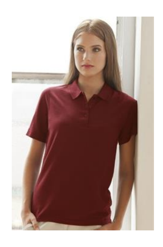
Style 2101 Women's Soft-Blend Double-Tuck Pique Polo

60% cotton/40% polyester, 5 oz. double-tuck pique body, solid trim, narrow three-button reverse placket, dyed-to-match polished pearl buttons, single-needle top-stitching, even-hem bottom with tailored sized vents, replacement button. Imported. XS-3XL.